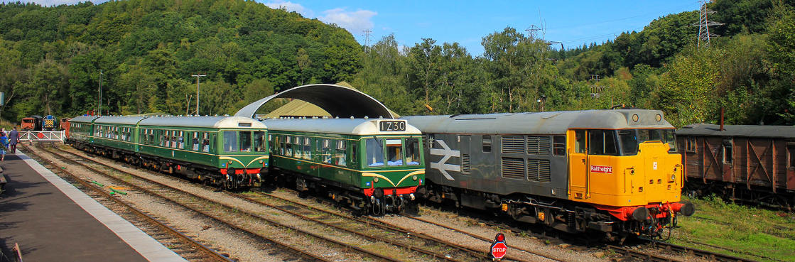
Above: View of the lower-level platform at Norchard with two early DMUs and Class 31 no. 31210 in Railfreight livery in the sidings. The arched roof in the background is over an extension to the workshop building behind it. Below: That's all for now! 'Small prairie' no. 5510 departing Norchard for Lydney Junction on the Dean Forest Railway

to Sharpness and thence to Berkeley Road on the Gloucester to Bristol line. Unfortunately on 25 October 1960 a runaway sea-going oil tanker barge, with another attached, hit the bridge and dislodged two spans. Subsequently it was decided not to effect repairs and demolition of the entire bridge followed. Lydney Town station brought back happy childhood memories of when, whilst holidaying nearby, my father took me on the local train (pannier hauled if I can believe my memory – the literature suggests that an 0-4-2T also worked this service) over the bridge as far as Sharpness, the first station on the south bank.