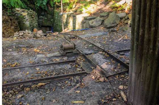
Above: New Venture Mine ( left ) the above-ground railway with a stub point and a siding leading to the waste tipping point ( right ) The access point to the mine, with its steep railway line to the above-ground facilities. Note the simple turntable

New Venture Mine: This mine is a recent development that is just coming into production. Its location is close to the Wallsend Colliery free mine but perhaps 100ft higher on a the wooded hillside above the site of the former Howbeech Colliery. The mine entrance is set into the hillside, with its railway track rising steeply up to the former Hamblins Mine turntable, which is close to the site building. From this one track runs a short distance to the former entrance to an adjacent mine, where now spoil is being tipped. Another track runs around the outside of the building and down the hillside, where coal will be transferred to road vehicles. With new stone walling around the mine entrance portal, steps up to the site and a bench outside for tea breaks this mine looks very established, and it is hoped that it will be a working mine for many years to come.