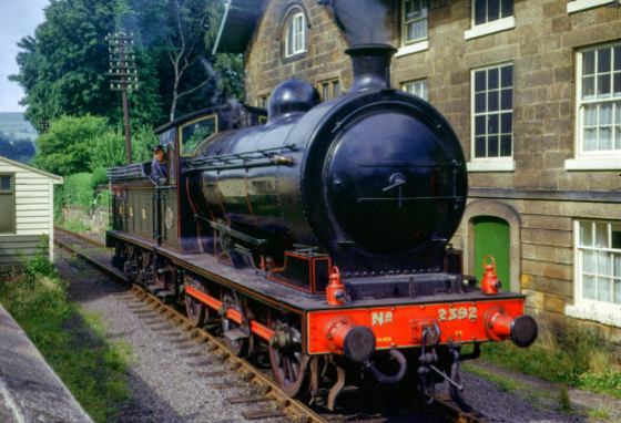
Left: Last-built and only surviving NER P3 (LNER/BR J27) 0-6-0, 2392 (BR 65894) runs round its train at Grosmont, during the summer of 1973

designs: 20 43xx 2-6-0s, 13 42xx 2-8-0Ts, three 47xx 2-8-0s and the final six 'Star' 4-6-0s. Then came Collett's first two 'Castles', 4073 Caerphilly Castle and 4074 Caldicot Castle (the last 10 'Stars' dating from 1922 and 1923 were later converted into 'Castles'). We should also mention the two 2-6-2Ts built for the Vale of Rheidol, nos. 7 and 8...