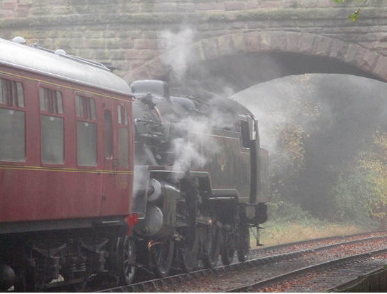
Left: Standard 2-6-4T 80080 in the mist at Wirksworth, prior to departure for Duffield

for the passenger service. The first train, consisting of Standard 2-6-4 tank loco No.80080 (bearing a wreath of red poppies) and five smart Mark 1 coaches, was due to leave at 10.50 am. Given the occasion, though, the departure time had been adjusted to a respectful 11.02am – directly after the national two minutes silence. Back in September I had been on a Pathfinder railtour from Pwllheli which