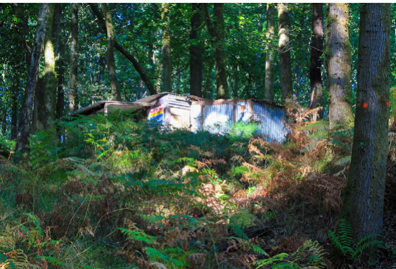
Left: Free mines – New Venture Mine surface plant seen on the hillside above Wallsend Colliery.

The article sparked my interest, so when I planned a short break last September I