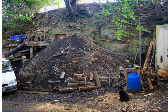
Above left: Monument Mine – railway layout for access to sieving; note the use of a wagon turntable Above right: General view of the Reddings Level Mine. The mine access is in the rock face to the right of the blue barrel. Mined coal is taken to the upper level on the left near the blue compressor for sieving Below Wallsend Colliery (left) The entrance to the mine, and (bottom right) the steep route of the railway from the mine entry/exit. The sieving equipment is beyond the blue tarpaulin on the left